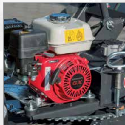
Drive via 230 volt electric engine or Honda petrol engine