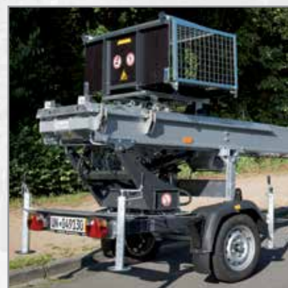
Compact chassis with integrated illumination