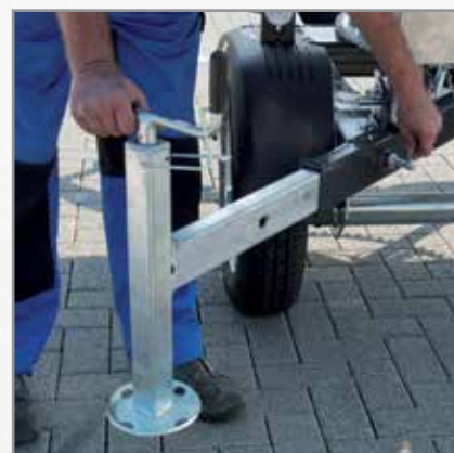
Extendable crank supports