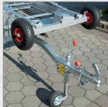
Drawbar with ball coupling permanently on the rails