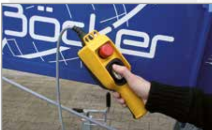
Electric pendant control operation from the base