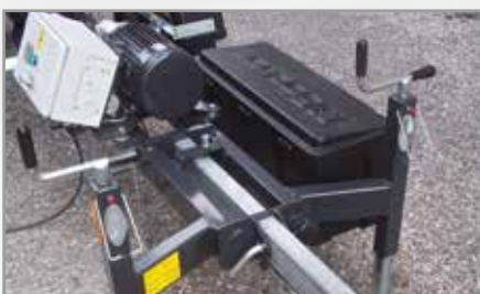
Amply and lockable tool box