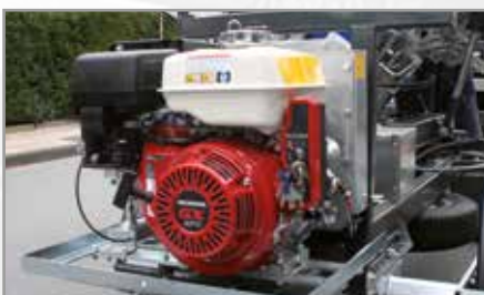
Petrol engine (optional)