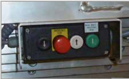
Electrical operation with creeping mode and Stop&Go function